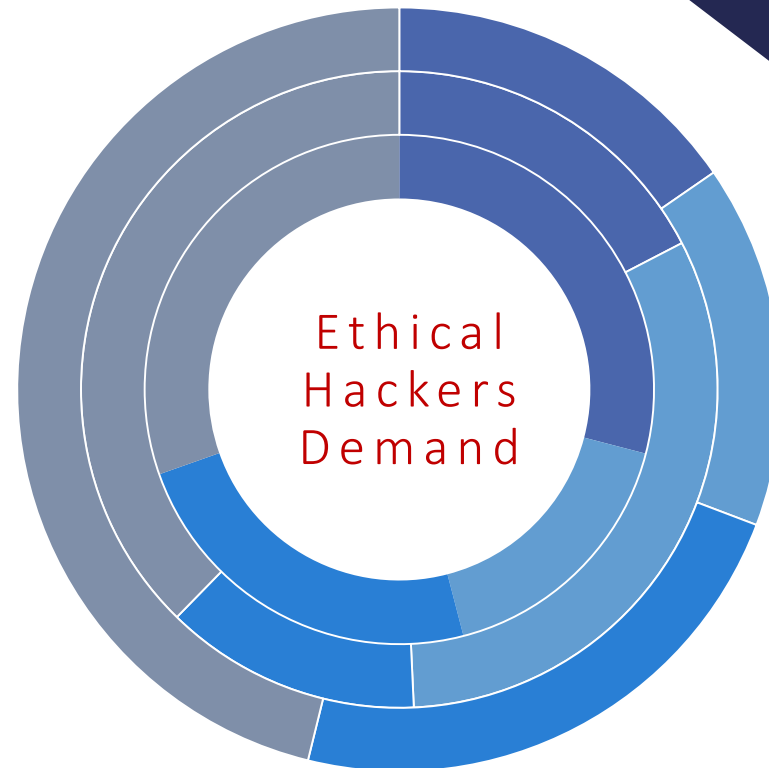
■ Software Development ■ Tester ■ Data Analyst ■ Security Consultant

Security professionals remain high in demand because a lot of Information Systems lack enough security features to protect against recent threats.